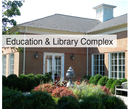
Education & Library Complex