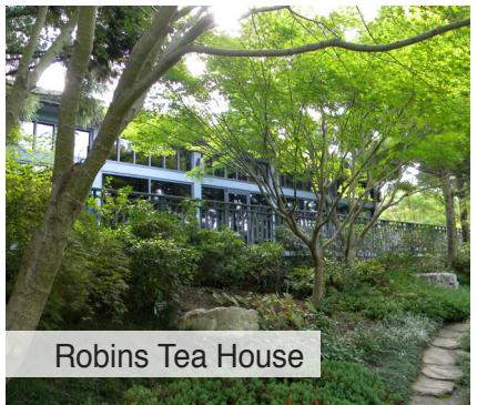
Robins Tea House